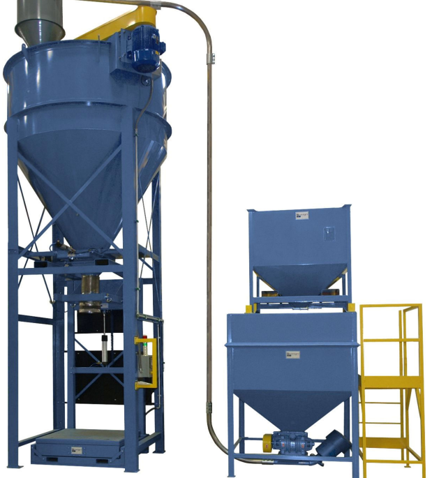
Pneumatic fill station w/ RAL, mixer, vacuum pump, receiver and automated bulk bag filler